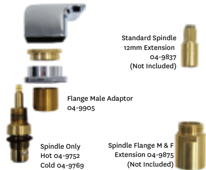
Standard Spindle & Handle Assembly Set up

Extended Spindles (Not Included) Hot 04-9707 Cold 04-9714 Flange Male Adaptor 04-9899