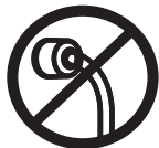
FIG 1. STOP DO NOT INSTALL HOSE THIS WAY

For commercial, industrial or parahealth use; ask your store consultant for correct shower selection.