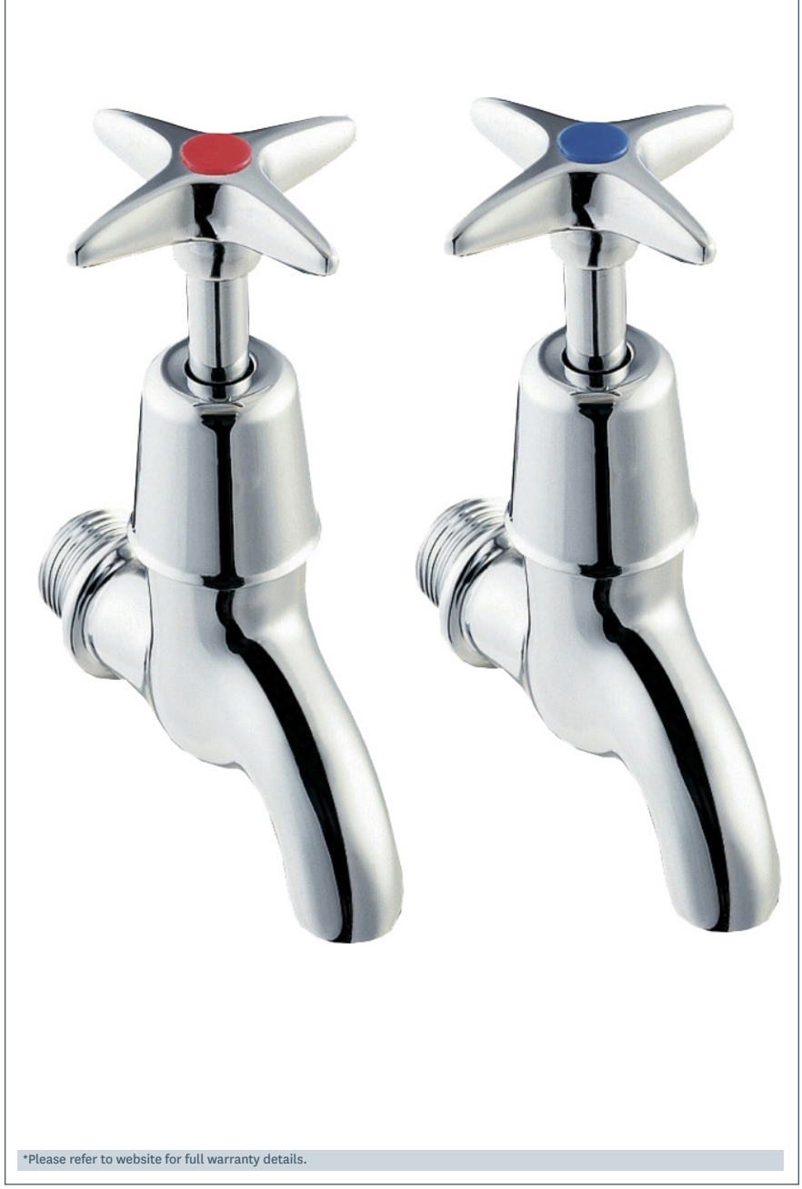
Flow (Bar - I/min, open outlet)