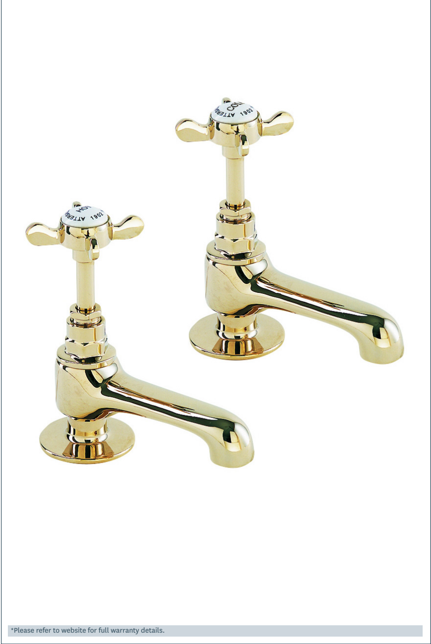
Flow (Bar - I/min, open outlet)