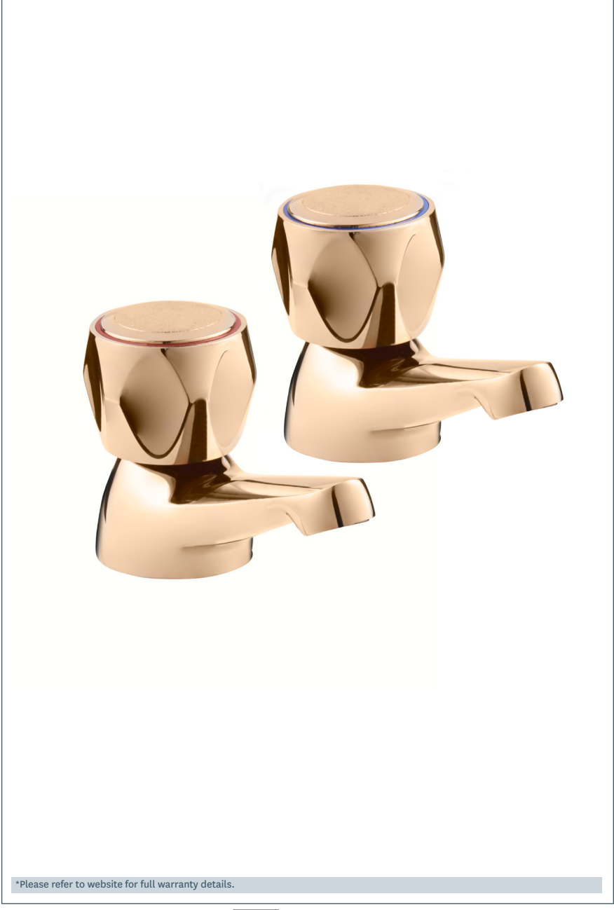
Flow (Bar - I/min, open outlet)