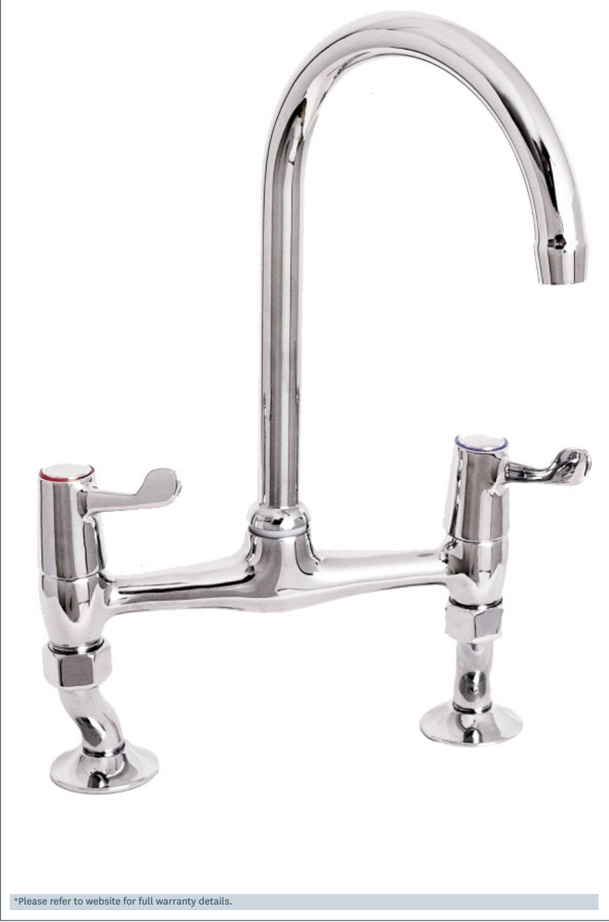
Flow (Bar - I/min, open outlet)