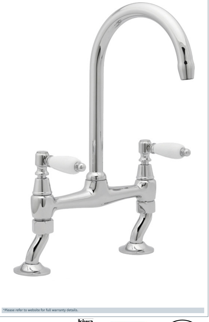
Flow (Bar - I/min, open outlet)